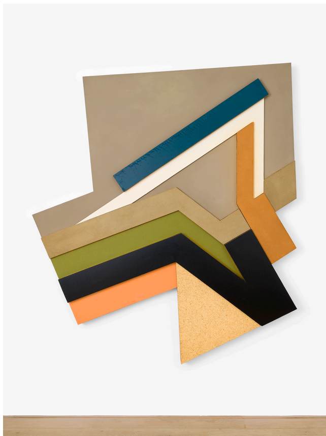
Frank Stella Lunna Wola II , 1973 Mixed media collage 246 x 217,8 x 12,7 cm

© Charles Riva Collection and Frank Stella / Hugard and Vanoverschelde