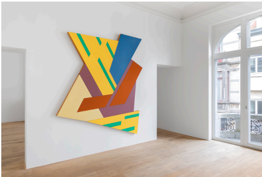
Installation view exhibition Frank Stella. Charles Riva Collection.

BRUSSELS.- For the first time, the Charles Riva collection presents an exhibition dedicated to the American artist Frank Stella. After several retrospectives devoted to him, the art of Frank Stella comes to the collection with his monumental works. The artist's process is revealed through his "Polish Village" series.